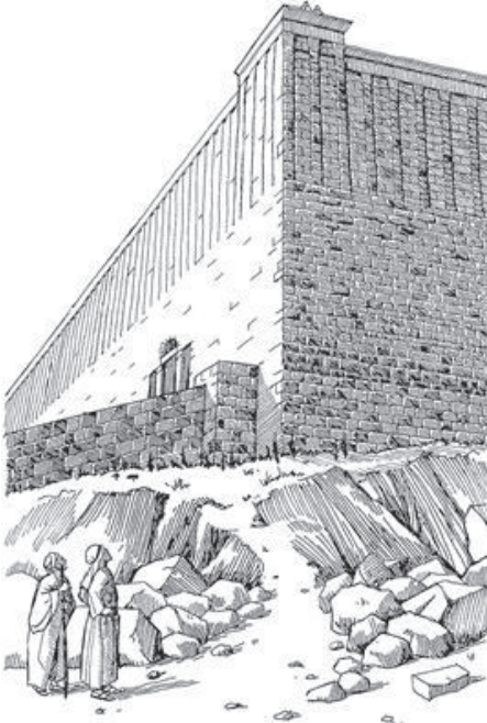
Enɛɛ e ince she sho shuhā (4:10)