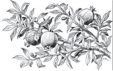
Ka hwɛɛɛ uti ni uyir a akpɔ e iye ku tũ (6:44)

46 “Uñwēẽ ku tuk ma yesha ime eti, ‘Itɛngashe, Itɛngashe,’ ni ma hã a kpenyim ubinɛ e ime shi kin hɛɛwinyim? 47 Ume e iye sha ba ni ime, bik a gɔɔ oye e ime, ni a kpea ubinɛ e ime shin hɛɛ, shín hɛɛwinyim uyir e iye sha sho. 48 A sho shɔukpe o uneke e iye sha bera ajini a aɛi, a shim ohwei oworowor, a tuk itɛi nishi a duɲ oshii. Amẽ a wur a ba dɛr aɛile, aɛile hã e jiiɔɔ, he imbɔɔ sha wɛjen ni ajin. 49 Ume e iye sha gɔɔ oye e ime, ni hã a kpei ubin e ime shin hɛɛ, a sho shɔukpe o uneke e iye sha jin aɛi ni obẽ, hã a shimi ohwei aduɲ oshii. Amẽ a wur a dɛr aɛile, aɛile a jiiɔɔ, iji a aɛile i sho ni iwei.”