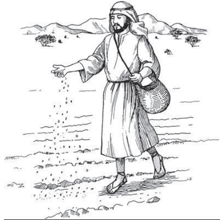
Uram a jēē anāāi e íkō, a nāā anāāi (8:5)

11 “Tō, oshui o ogben o oyeice ne. Íkōi i sho oye o Ushe. 12 Inyom e iyōō shi jishaa ni udē, i sho abom e imbōō sha gōō oye o Ushe, Injirigō a ba nenihe oyei ni akele e imbōō, ní imbōō a nēhē a jēhē ijii ní a neke a dok enaŋa. 13 Inyom e iyōō shi jishaa ni irōk i sho abom e imbōō sha gōō oyei ni a ai ni eshutik, oyei o sheice ni oshī ni imbōō. Imbōō ka jēhē ijii inom kepiu. Ocu e emaka sho ba ni imbōō, a ārŋibōō. 14 Inyom e iyōō shi jishaa ni ahou ni enej e idōk shi sho, i sho abom e imbōō sha gōō oyei. Sha rō ni a shir, aberi a abin o odē, icibi ni iban o odē, a nyāhē imbōō a shoi ni ogau. 15 Inyom e iyōō shi