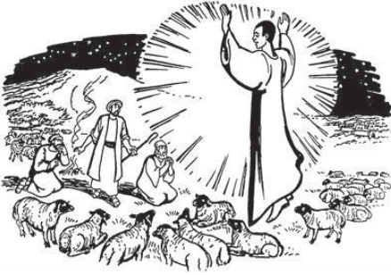
Umeleka e Iteṅgashe u ba u param ni imbɔɔ (2:9)

8 Ni ushīha, aner a yara e idɔi a sho hum ni ahou ayoayo, a nāa ajepi e idɔishe e imbɔɔ. 9 Umeleka e Iteṅgashe u ba u param ni imbɔɔ, igɔŋ e Iteṅgashe i raŋ i kēēkpē imbɔɔ, iwei i ḍurbɔɔ. 10 Iye eti, “Ma nēhē a gōōi iwei, in kōwā inyime oye sho bana, shó kō agwira a akele sha rē a ba ni aneke kocak: 11 Enye ni oteu e iDauda a marke inyime uner a anāŋa. Iye a sho shu tūā, a Iteṅgashe. 12 Iyene shá tuk inyime ma hwɛŋ: Ma shá jē uŋwē sha burke ni eta ni a nɔ ni ujo.”