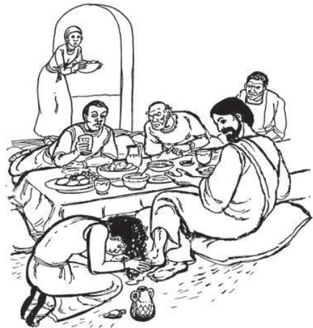
Ucei a āāṅacē a hwurihe adake e iYesu ni oēē (7:37)

31 Eti, “Tɔ, shín gbokpa aner o ugaihanē ni uṅwēē? A sho ninebɔɔ? 32 A sho shɔukpe aṅwē sha cika e imbɔɔ sha sher ni eje, a yesha andɔkbɔɔ eti, ‘Ke barke inyime apīa ma kpēnyim ajeti. Ke kō icima, ma kpēnyim aāṅi.’ 33 Imii, iYohanna uner o ubaptisma a ba, hā ka lei ubin a alea, hā ga hwai ubin shu hīa, inyime a hēē eti, ‘A sho ni iṅkirigō!’ 34 Uṅwēne o Uneke a ba, a ba ale ni ahwa, inyime a hēē eti, ‘Unerhane a sho uner a alei a abin ni uner a ahwai abin she hīa, indɔke a aner a aishi