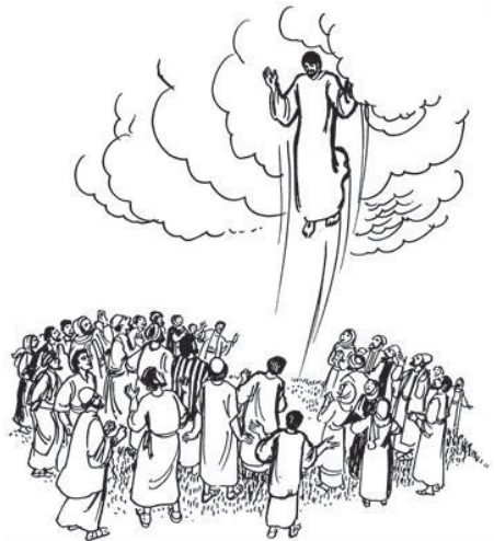
A nɛnɛ iye a jēēbɔɔ ni ahārā (24:51)

rusha eti, “Ma sho ni ubin a alea ni hē?” 42 Imbɔɔ a jēhē oci e ica shi huma. 43 Iye a ai a tā ni ashu e imbɔɔ 44 ni a hɛɛ eti, “Irēmŋwē e ime shin yea ni ocu e ime shin sho ni inyime eti, abin e imbɔɔ sha leta ni ece e ime, ni ileta e iMusa, ni igur a anebi, ni iZabura, shé a tɔkiyɔ.” 45 A cirkihe akele e imbɔɔ, ní imbɔɔ a hwɛɲ abin e iŋkɔɔ shi ta leti kɔɔ ni oye o Ushe, 46 eti, “A leta ishɔuhane, shu tūāha shá hwa ihārā, unom entarke, a shoke ni ojeek. 47 A shá domihē aneke e imbɔɔ shi hā a hwɛɲibɔɔ Ushe, odomaa a mɛɛk o obur ni idē shi biwi, ni a yishi o uhau ni ocoke e iye, sha shai ni Ushelima. 48 Inyime a sho amper ashu a abinhane kocak. 49 Ma jē, ime shín jawinyim ubin